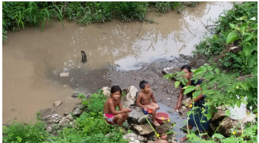
Dirty contaminated bathing area.

For God so loved the world that He gave His only begotten Son, that whoever believes in Him should not perish but have everlasting life. John 3:16