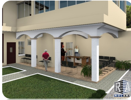
Proposed drawing for the new addition to the clinic.

We have so many more photos and videos on our web site. Please make sure to check them out.